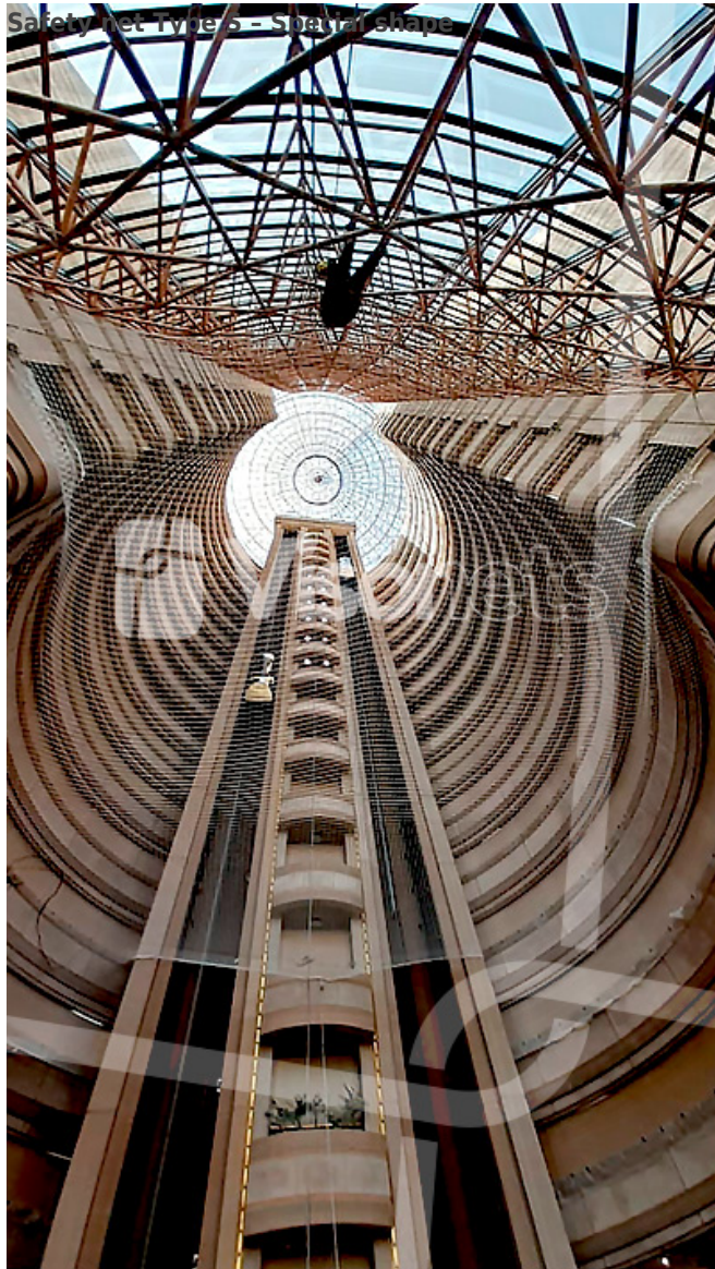
Safety net Type S - Special shape

Let's see one of the latest special Project: A customer came to us asking if is posible to make a safety net with a very speacial shape, because they have to install it for protecting the fall people and debris in maintenance labours inside a big rated hotel. The solution with netting had to protect the worker and the hotel clients because the net will have to be just up in the lobby.