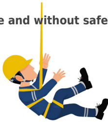
Worker with lifeline and without safety net